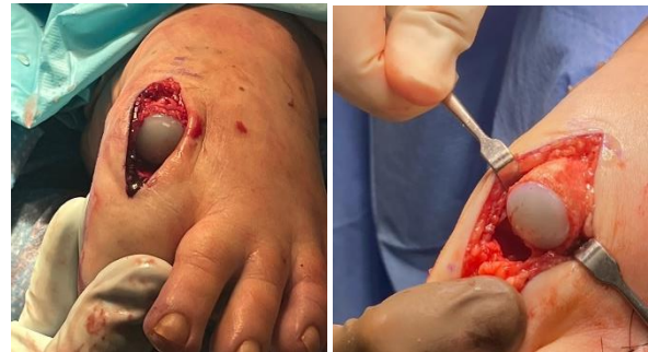
Figure 6: BioPoly Implant

There was appropriate stable fixation obtained with periphery fit to the cortical margins and without any micromotion noted. Intraoperative fluorography confirmed adequate placement of the implant and correction of any previous deformity ( Figure 7 ).