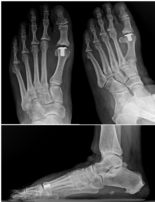
Figure 8: Post-Operative Radiograph

This patient was placed into a posterior splint with non-weightbearing recommendations for approximately 2 weeks. Sutures were removed at the 2-week visit, and she was transitioned into a CAM boot with full weightbearing capabilities. She was also educated on a home exercise program to start at this time. She was then progressively weaned out of the CAM boot between postoperative weeks 4 to 6. She was seen at 8 and 12 weeks postop, with resolution of all pain and complete return to regular shoe gear without limitations. She also noticed no restrictions in activity level, with full return to exercising and other activities she had not been able to partake in for