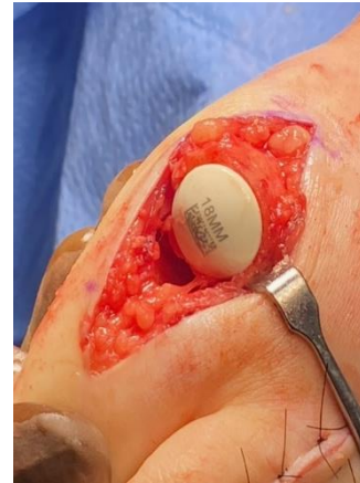
Figure 5: Trial Implant

A temporary guide wire was applied into the cut surface of the metatarsal for stem placement and initial implant sizing instrumentation ( Figure 4 ). The instrumentation confirmed a size 18mm BioPoly implant to be optimal to resurface the metatarsal head as it covered the cut surface without protruding over the edge of the remaining metatarsal head. The appropriate size reamer was applied over the guide wire and utilized to prepare the distal metatarsal for the stem of the implant. After this, the guide wire was removed and an 18 mm trial implant was applied ( Figure 6 ). The trial implant fit well, and so all remaining osteophytes and other osseous prominences were resected with a sagittal saw and rongeur until smooth. With resection of all arthritic changes and optimal implant size confirmed, the trial sizer was replaced with the permanent 18 mm BioPoly implant in press fit fashion ( Figure 6 ).