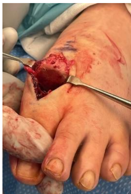
Figure 4: Metatarsal head osteotomy