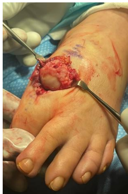
Figure 2: Joint Exposure

A dorsomedial longitudinal incision was performed, followed by atraumatic dissection to the metatarsophalangeal joint capsule. All vital structures and extensor tendons were protected throughout. A dorsal longitudinal capsulotomy was performed and the capsular tissues were gently reflected across the dorsal + medial + lateral metatarsophalangeal joint. A large loose osseous body from the dorsal joint was resected. A McGlamry metatarsal elevator was then introduced into the joint for release of the sesamoid apparatus and constricted plantar capsular tissues. Next, the dorsal osteophyte was removed from the dorsal metatarsal head and the proximal phalanx base locations. This allowed for optimal visualization and access to the joint for next steps in the surgical protocol ( Figure 2 ). The metatarsal head had significant degenerative changes, and the proximal phalanx base had a significant amount of adequate cartilage remaining which is important since the BioPoly implant is intended to articulate with cartilage.