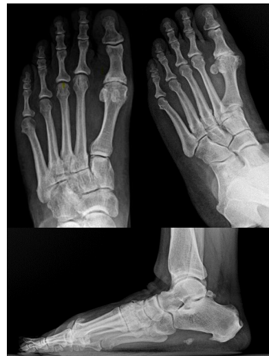
Figure 1: Pre-Operative Radiograph

Neurovascular status was fully intact. There were no open lesions or signs of infection to any location. Left foot and ankle had well-healed surgical locations. The left foot and ankle had no residual pathology or recurrent deformity/pain. The right first metatarsophalangeal joint had a significant dorsal and medial osseous prominence present. There was pain with palpation of this joint dorsally and medially. There was also significantly limited motion of the first metatarsophalangeal joint, measuring at less than 30-40 degrees of maximum dorsiflexion and with an abrupt stop at the end range of dorsiflexion. There was pain with motion of this joint actively and passively. No pain or deformity was appreciated elsewhere. Diagnostic imaging revealed grade 4 hallux rigidus with osteophyte and loose osseous body formation ( Figure 1 ).